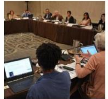
WERA/AERA Convene Meeting of the Americas, Washington, Sept 2016