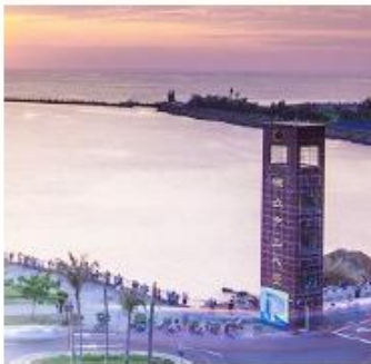
WERA Council Meeting and Symposia at APERA-TERA, Taiwan, Nov 2016