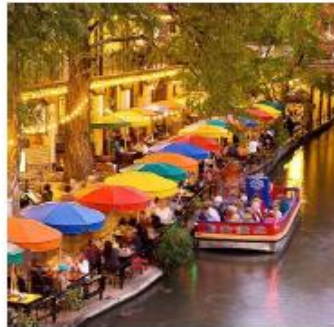
Upcoming WERA Council Meeting at AERA, San Antonio, May 2017