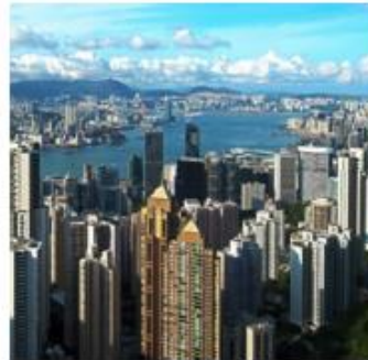
WERA Focal Meeting, Hong Kong, Nov 2017: Call for Submissions